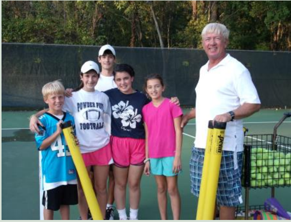
Tennis at WRCC

The cold weather has arrived. Tennis clinics and lessons have started back up, so bundle up for fun on the courts!